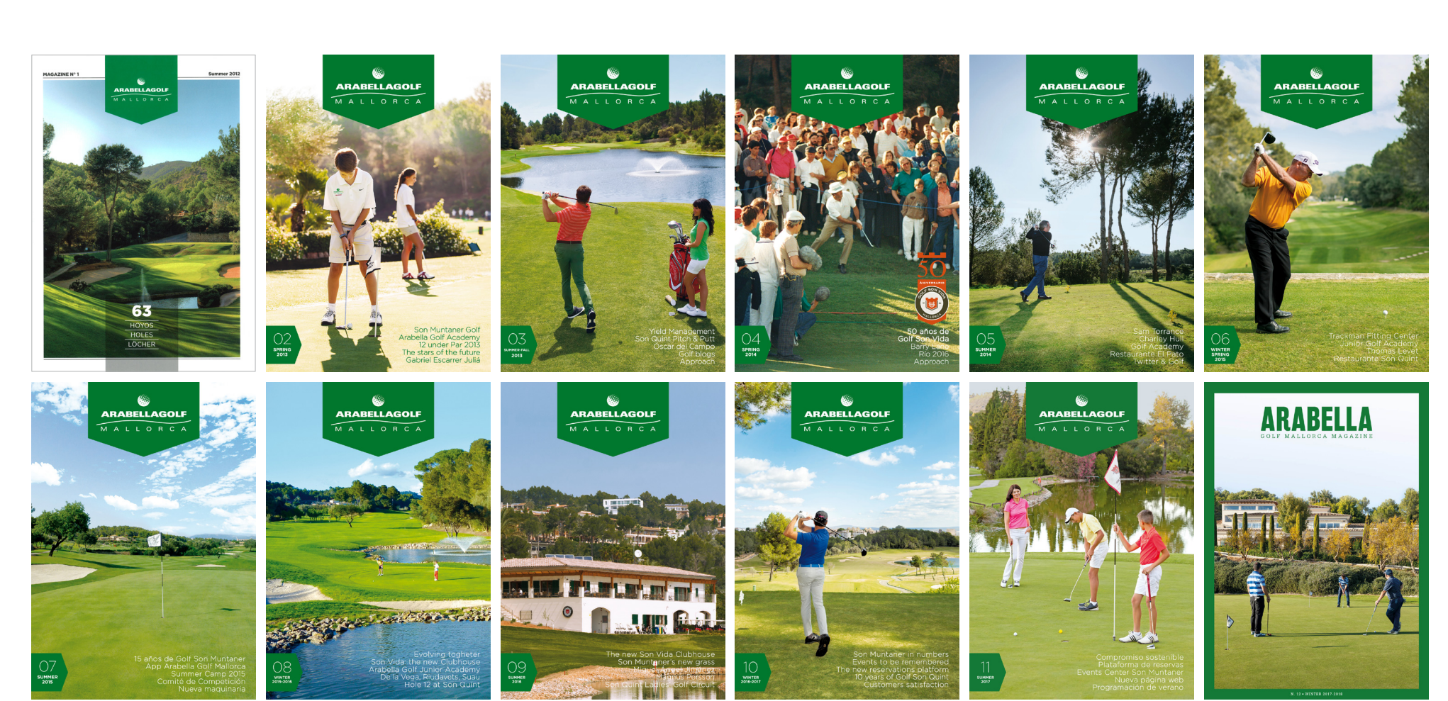
Magazine Media Kit 2018